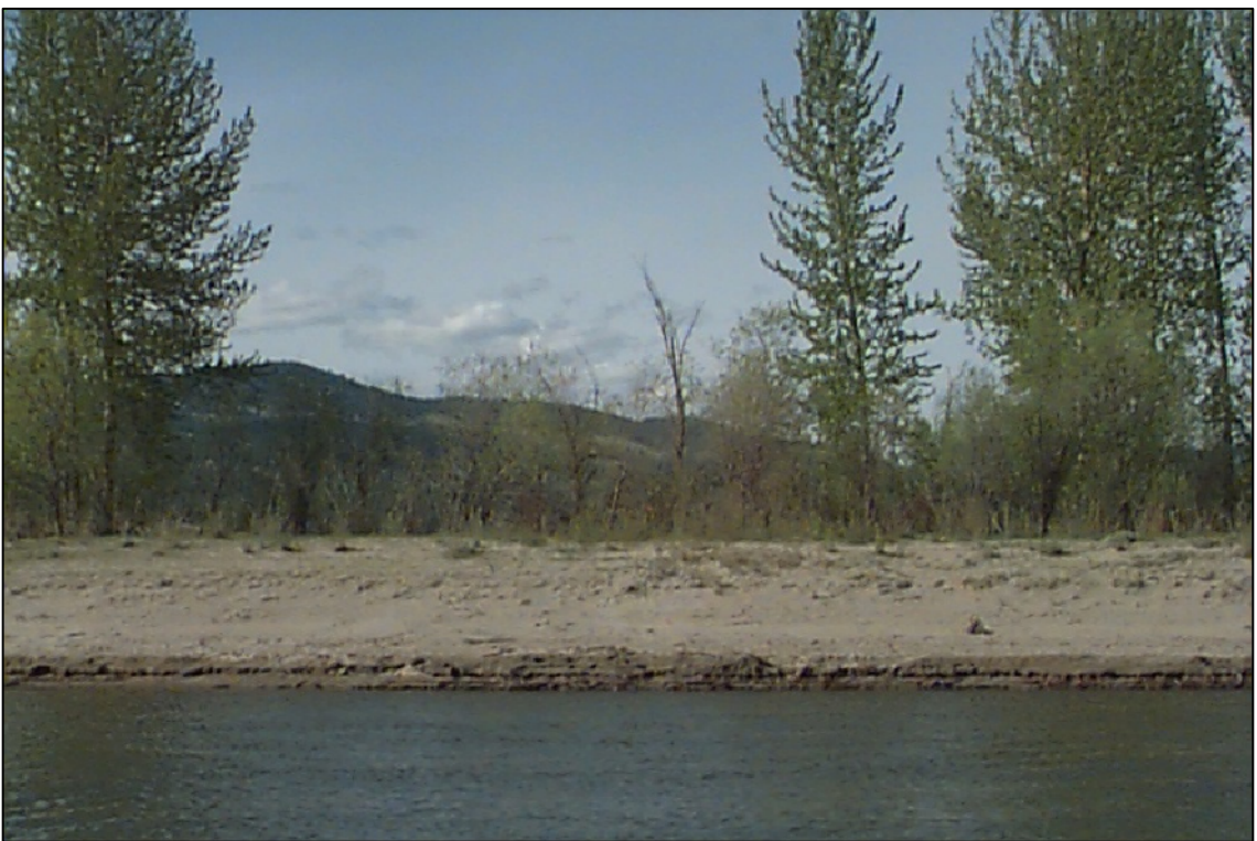
RIGHT BANK VIEW