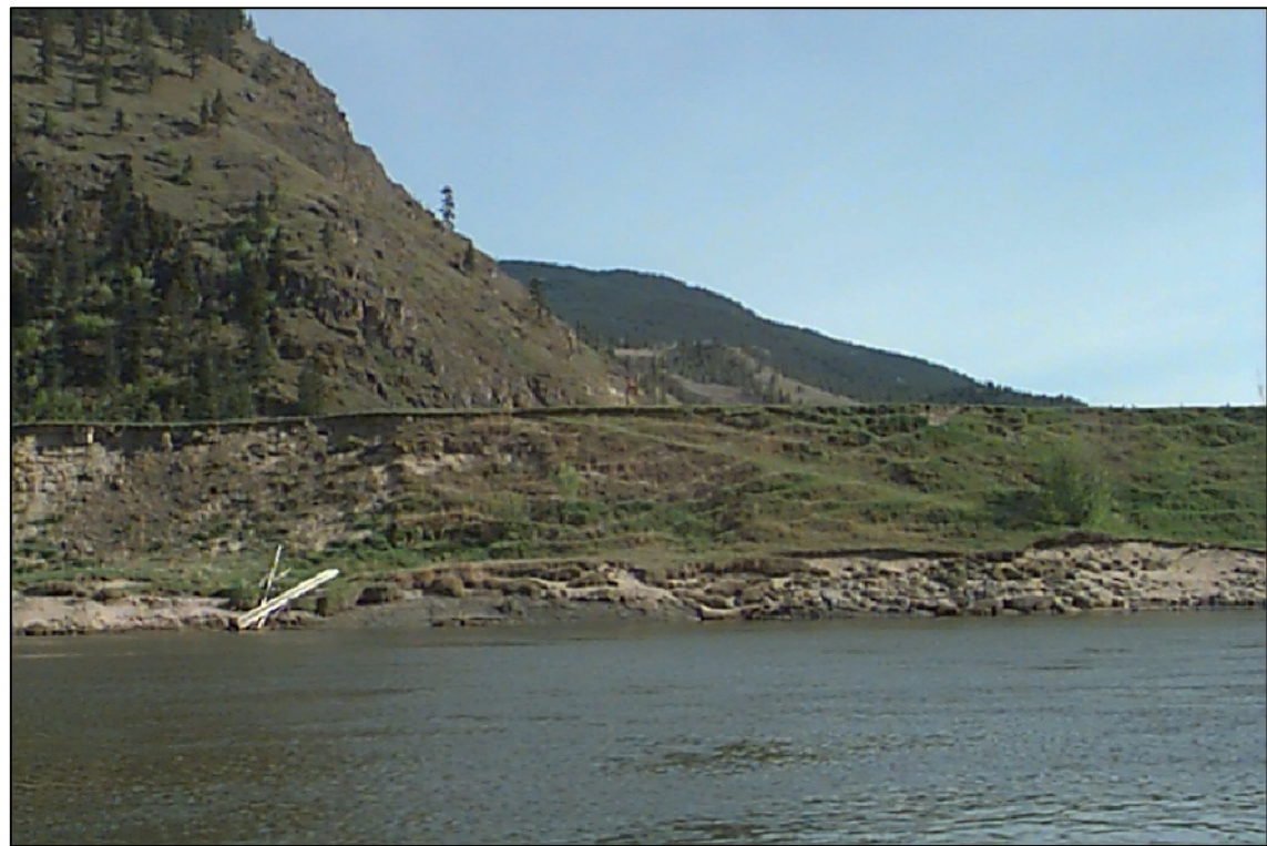
LEFT BANK VIEW